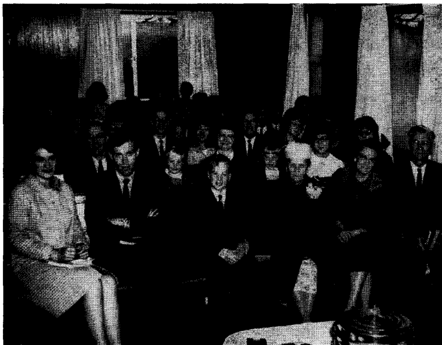
SEATTLE CONGREGATION IN ITS NEW MEETING-PLACE 28th Avenue S.W. and S.W. Holden Street

As pastor and people became increasingly concerned about their independence from any church fellowship or control, they looked about for a church body "which represented our